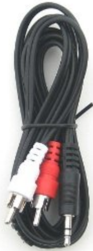
RiteAV - 3.5mm Stereo Headphone Cable - 12ft. From Amazon.com